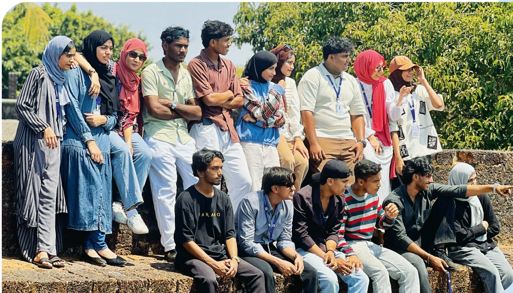
Visit to Hermann Gundert Museum, Thalassery