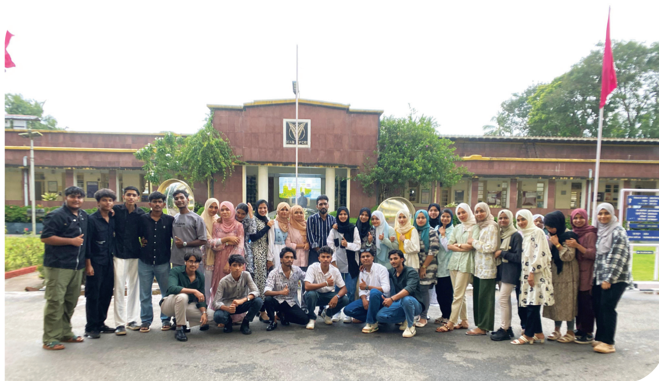
Academic Visit to CPCRI