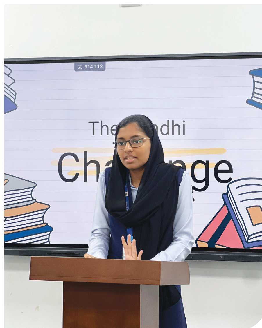
'The Gandhi Challenge' – A Gandhi Jayanti Programme