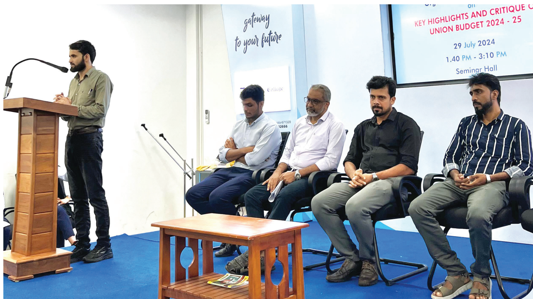
Student Discussion on 'Key Highlights and Critique of Union Budget 2024-25'