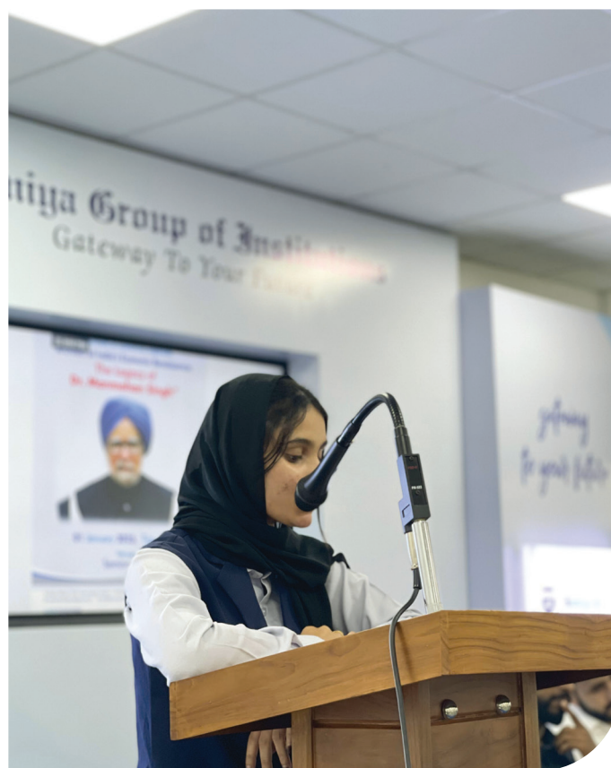
Architect of India's Economic Renaissance -The Legacy of Dr.Manmohan Singh