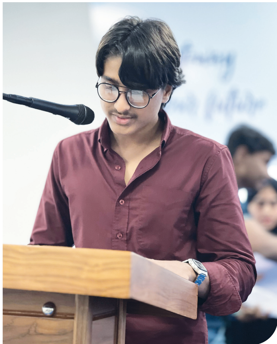
Discussion on the Landslide Incident in Wayanad

Join us at the Economics Department of Kuniya College of Arts and Science, where you will embark on a path toward intellectual enrichment, academic excellence and a meaningful career in economics.