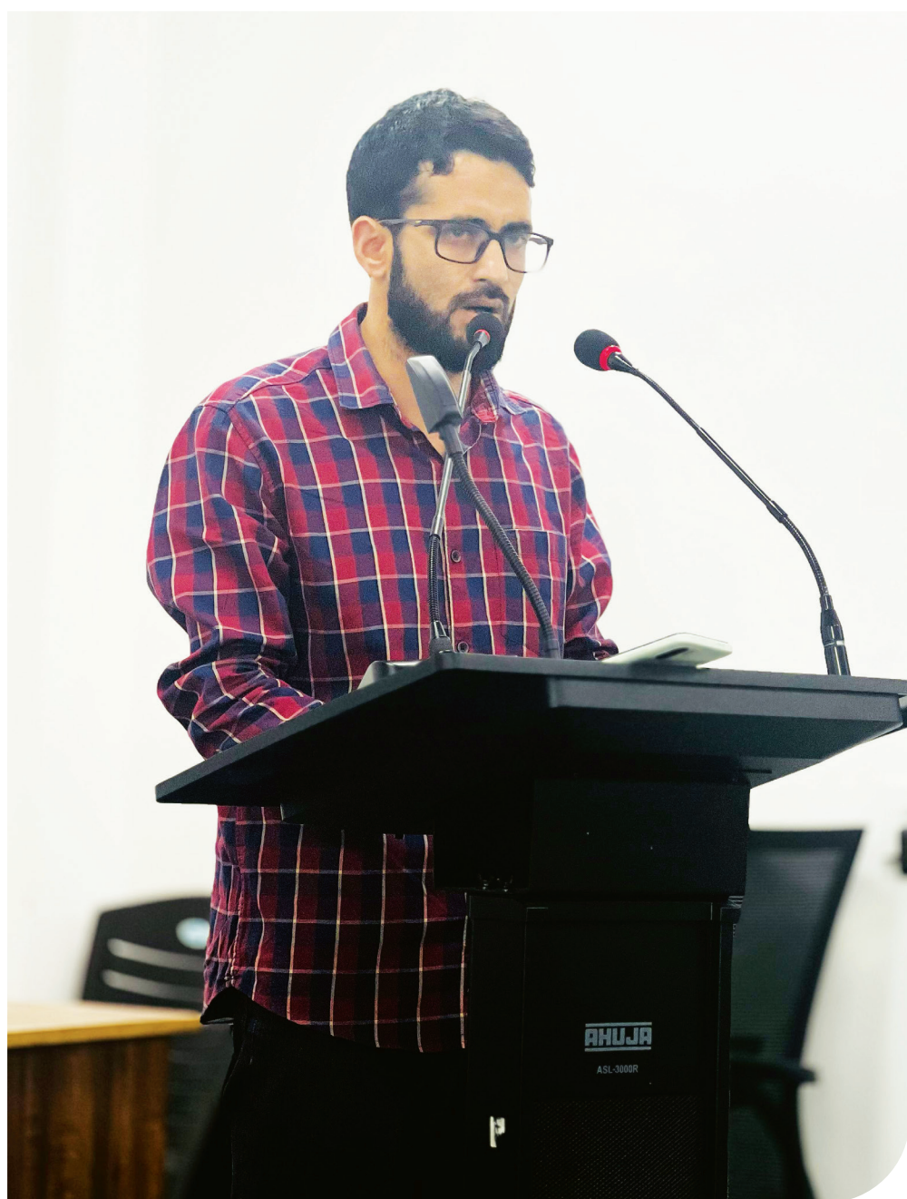
Invited talk on “Union Budget 2024 Unveiled Delving into Intricacies & Analysing Implications”