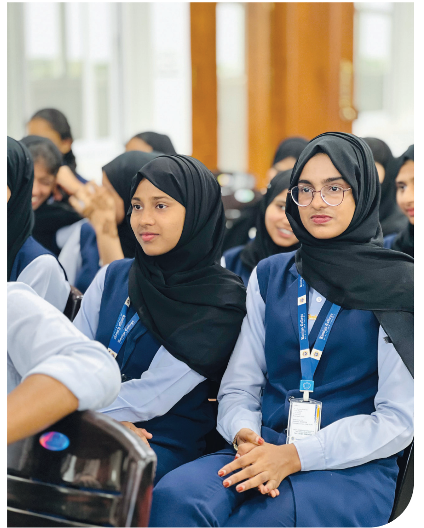
Discussion on the Landslide Incident in Wayanad