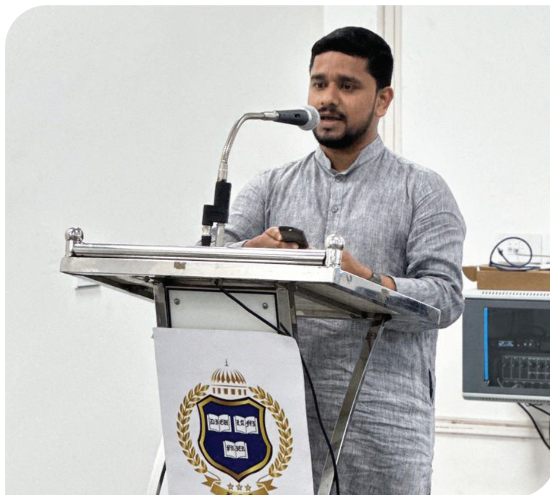
G20 summit -Round Table Discussion