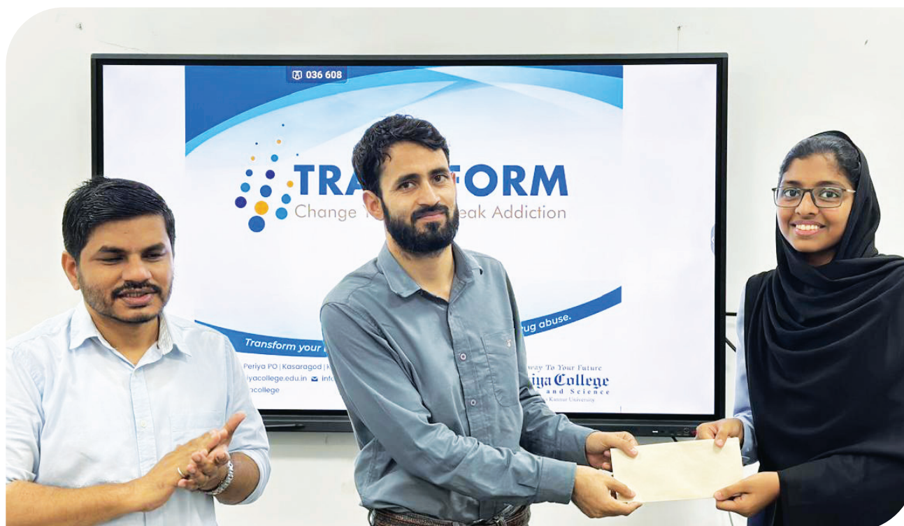
Transform Change Your Life, Break Addiction series-Sudoku Challenge