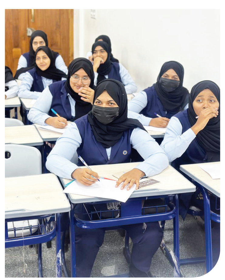
Transform change your life break addiction series- Memory Test challenge