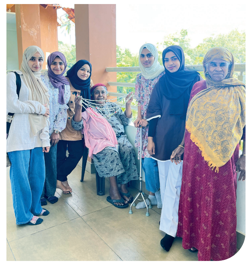
Visit to 'Peace Village' Palliative Care Unit, Wayanad