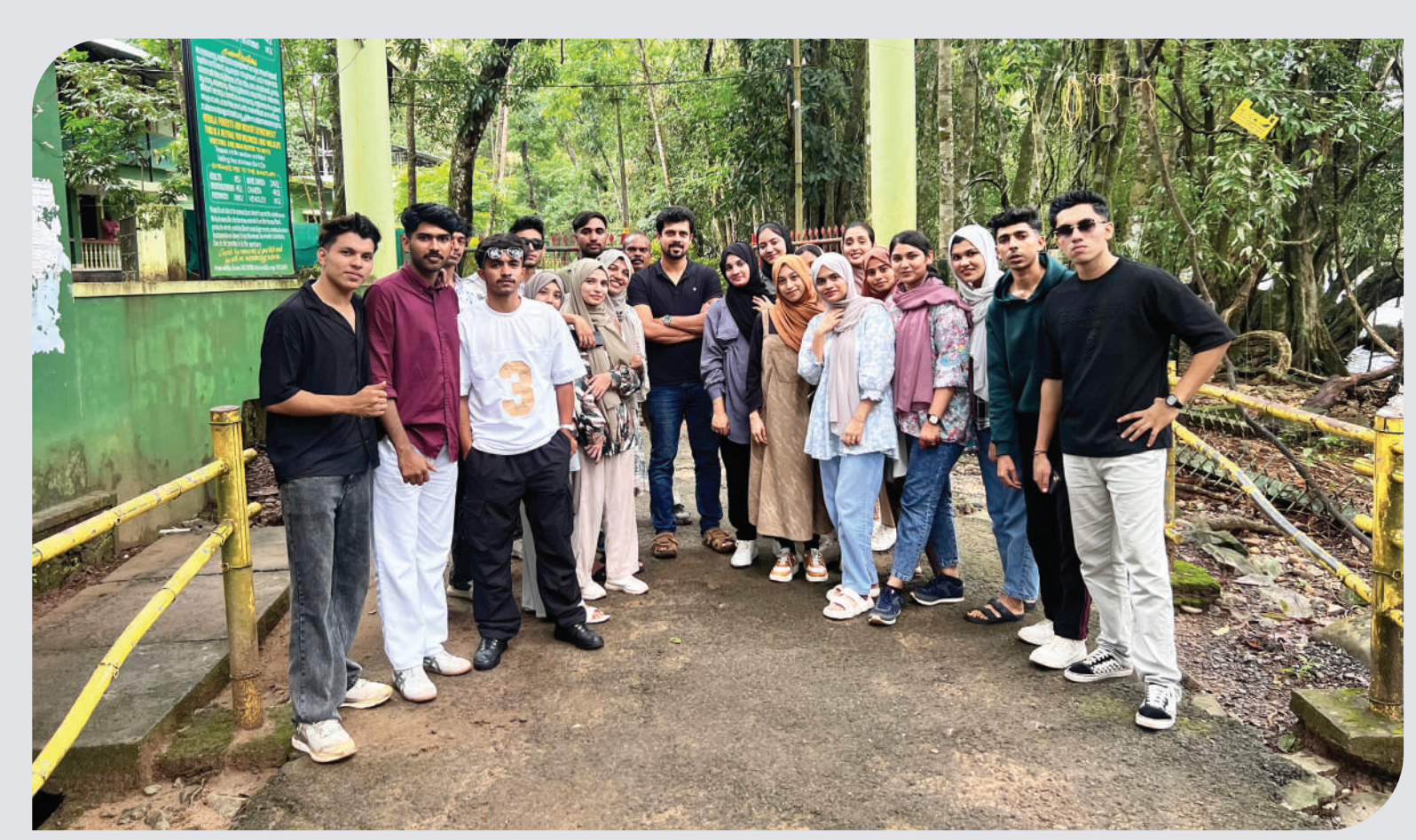
Visit to Aralam Wildlife Sanctuary, Kannur