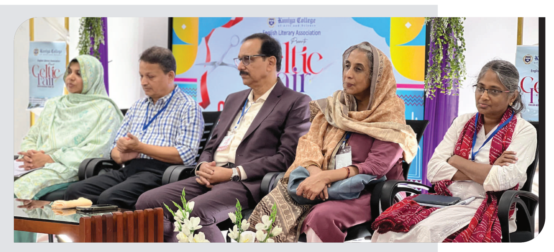
Grand Opening of Celtic Fair programme Organized by the English Literary Association