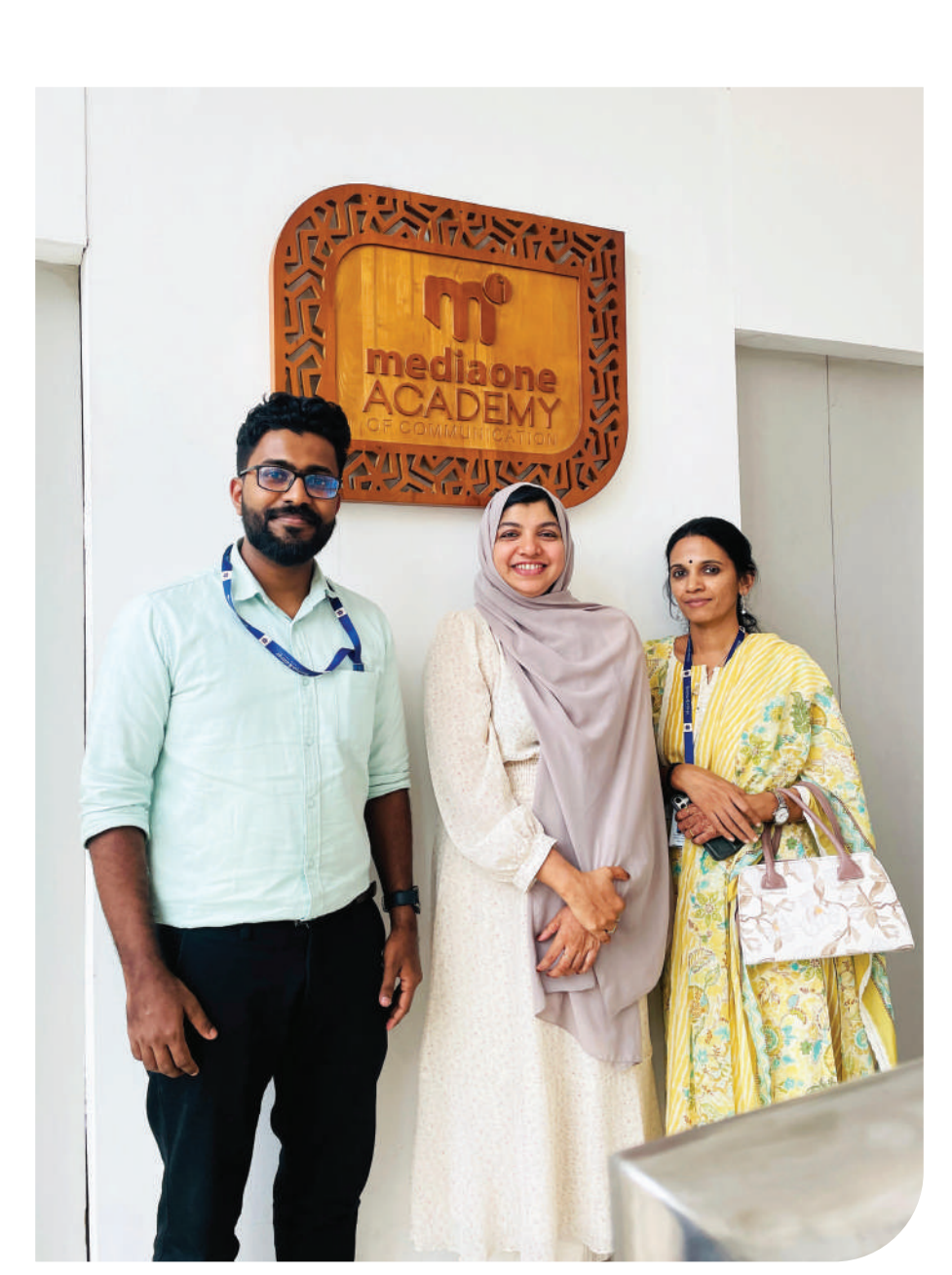
Visit to MediaOne Academy of Communication, Calicut