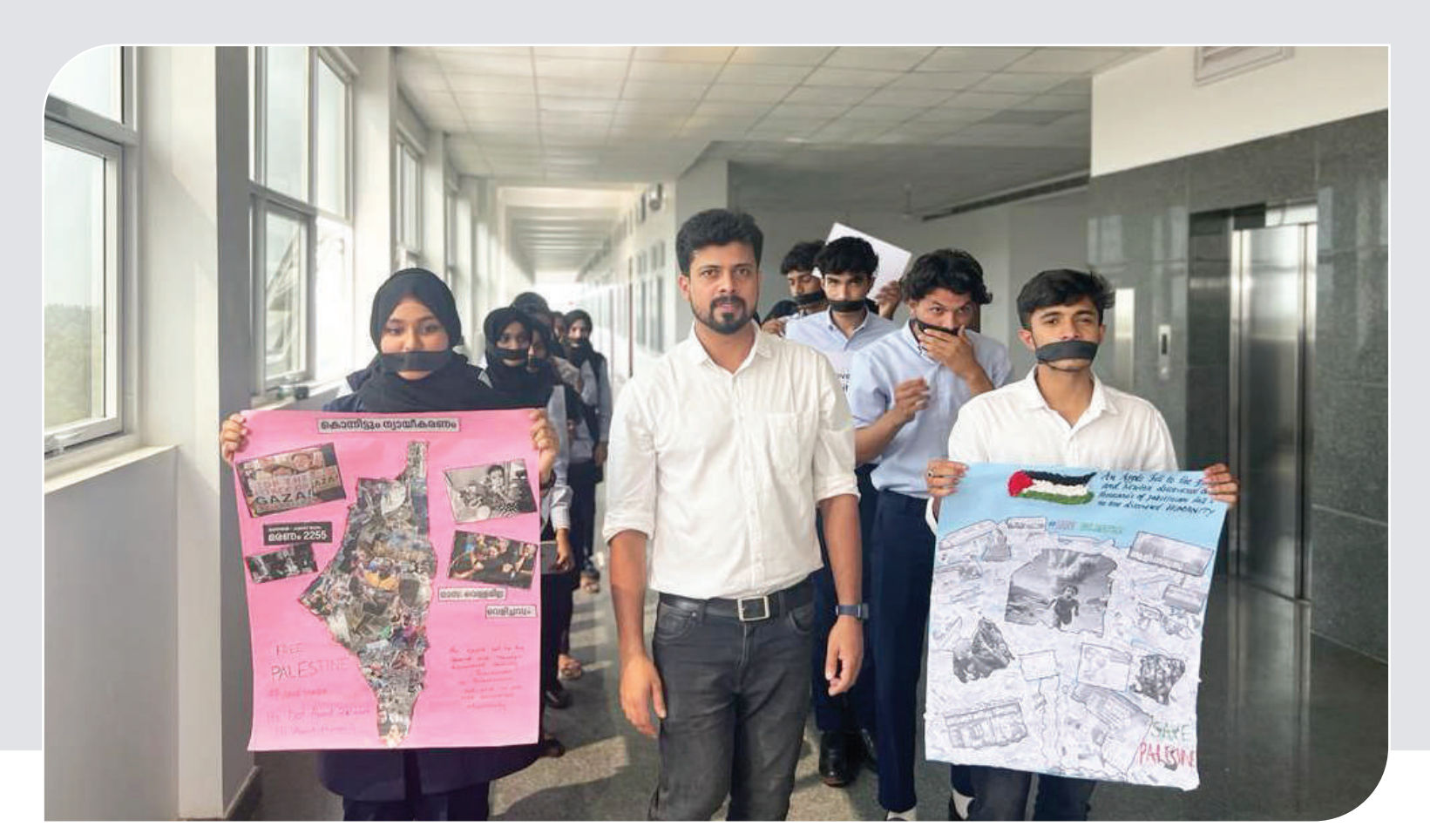
A powerful protest through words and art by the Department of English standing in solidarity with Palestine