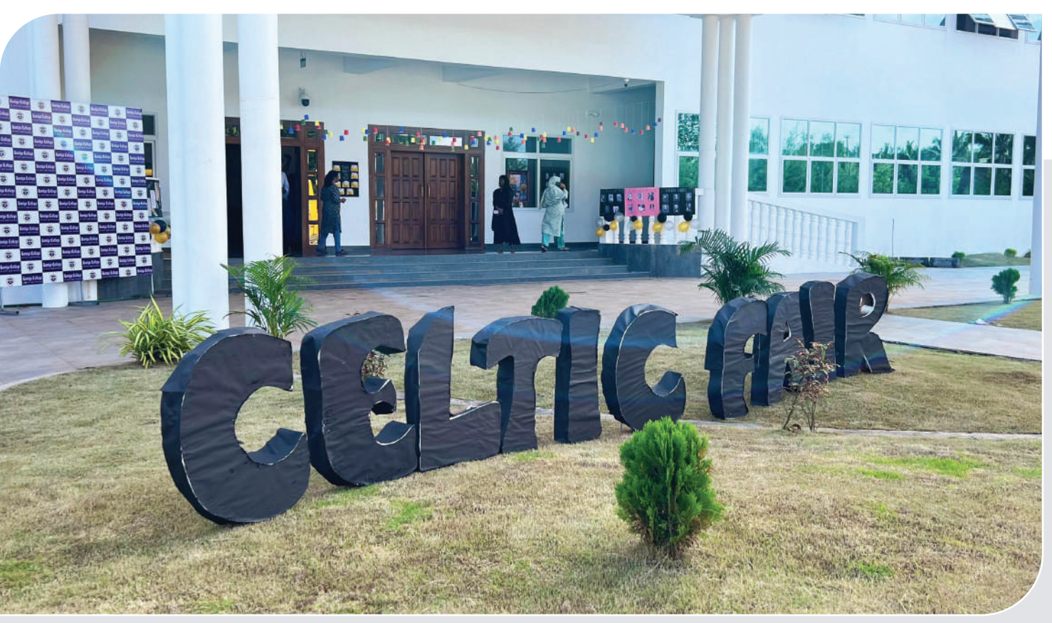
Grand Opening of Celtic Fair programme Organized by the English Literary Association.