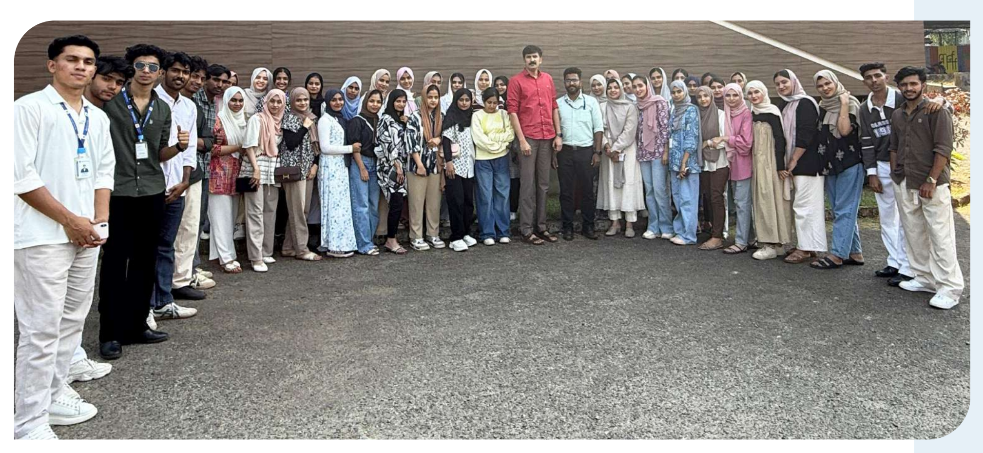
Visit to MediaOne Academy of Communication, Calicut