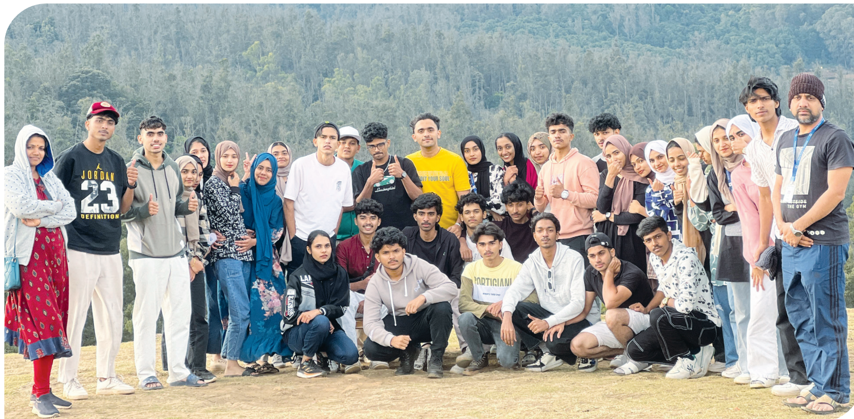
Academic Excursion to Ooty