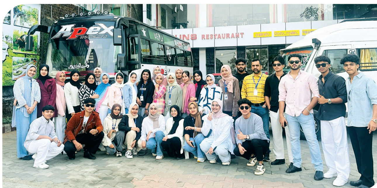
Academic visit to tea and chocolate factory, Ooty

The curriculum's blend of commerce and technology equips students with the skills needed to excel in these roles.