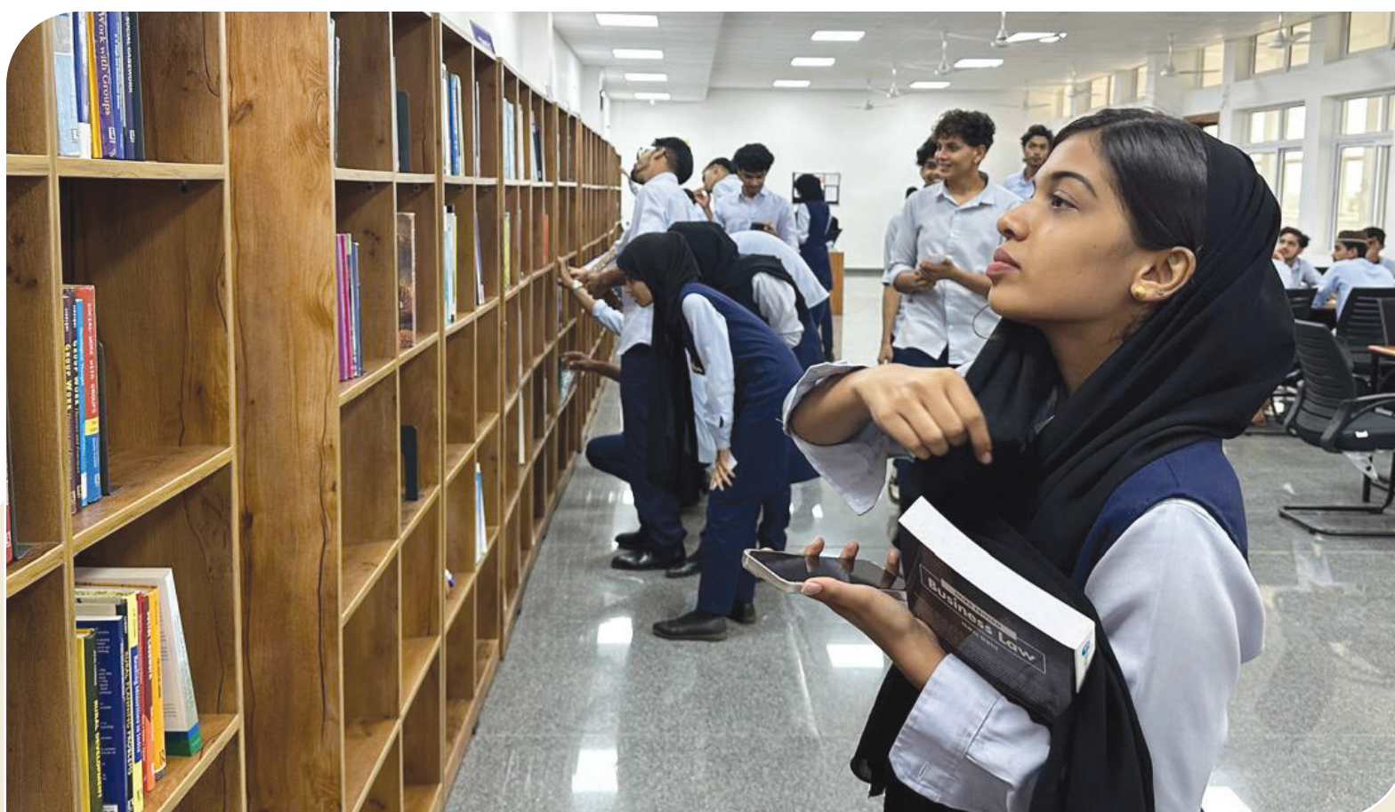
Transform change your life break addiction series-Book hunt challenge