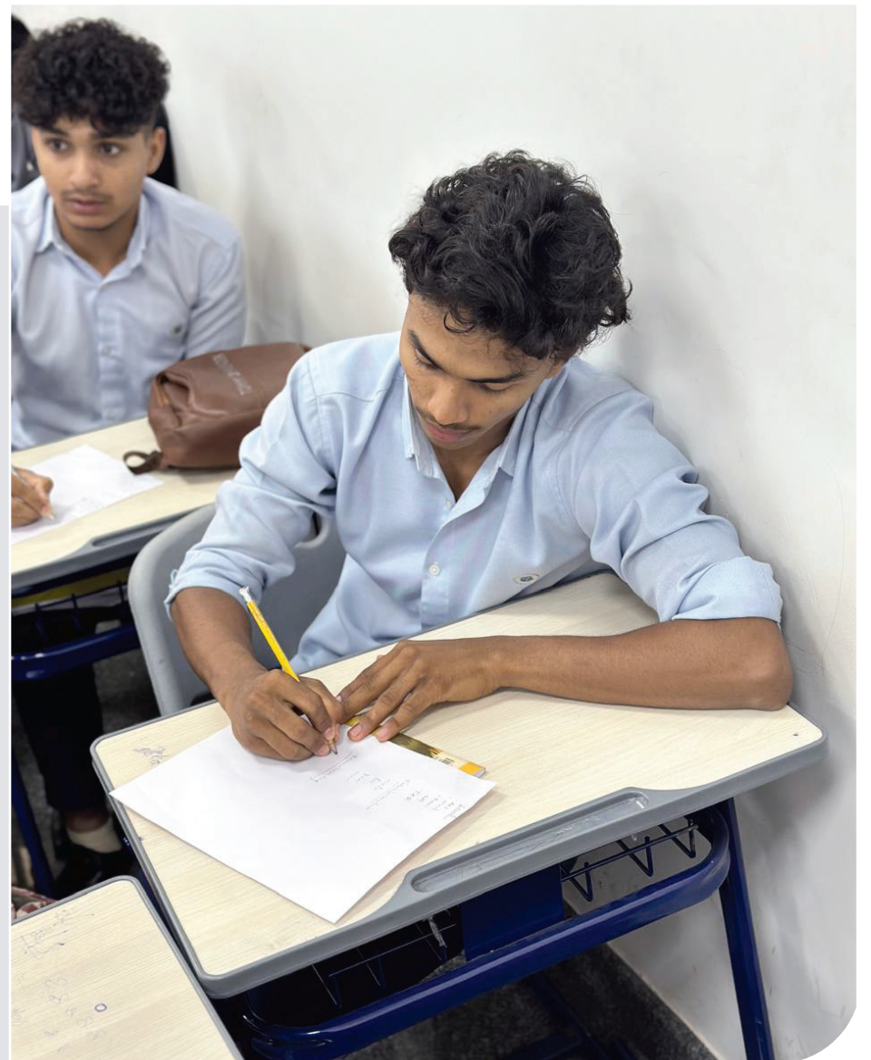
Transform change your life break addiction series-word hunt challenge