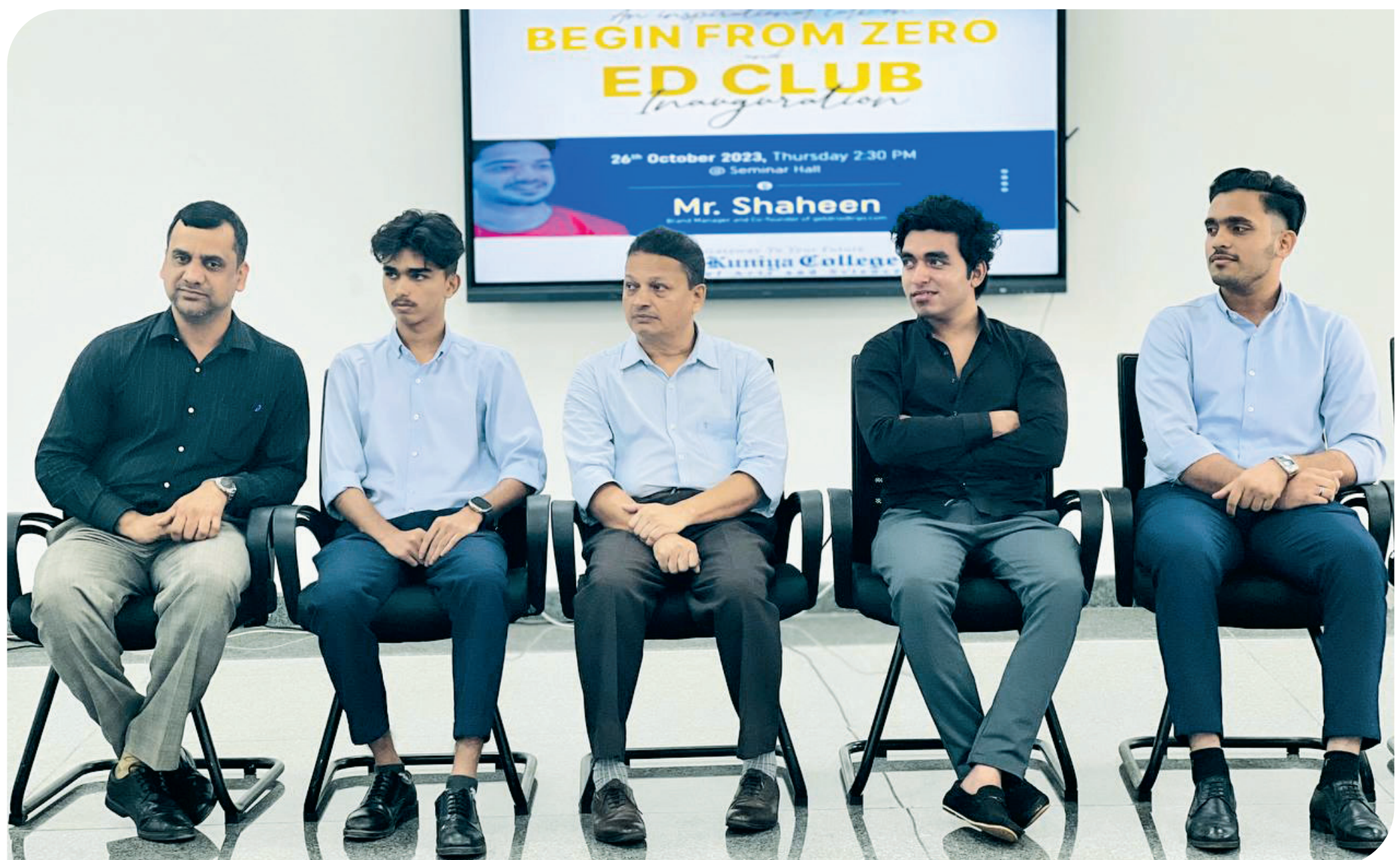
ED Club Inauguration