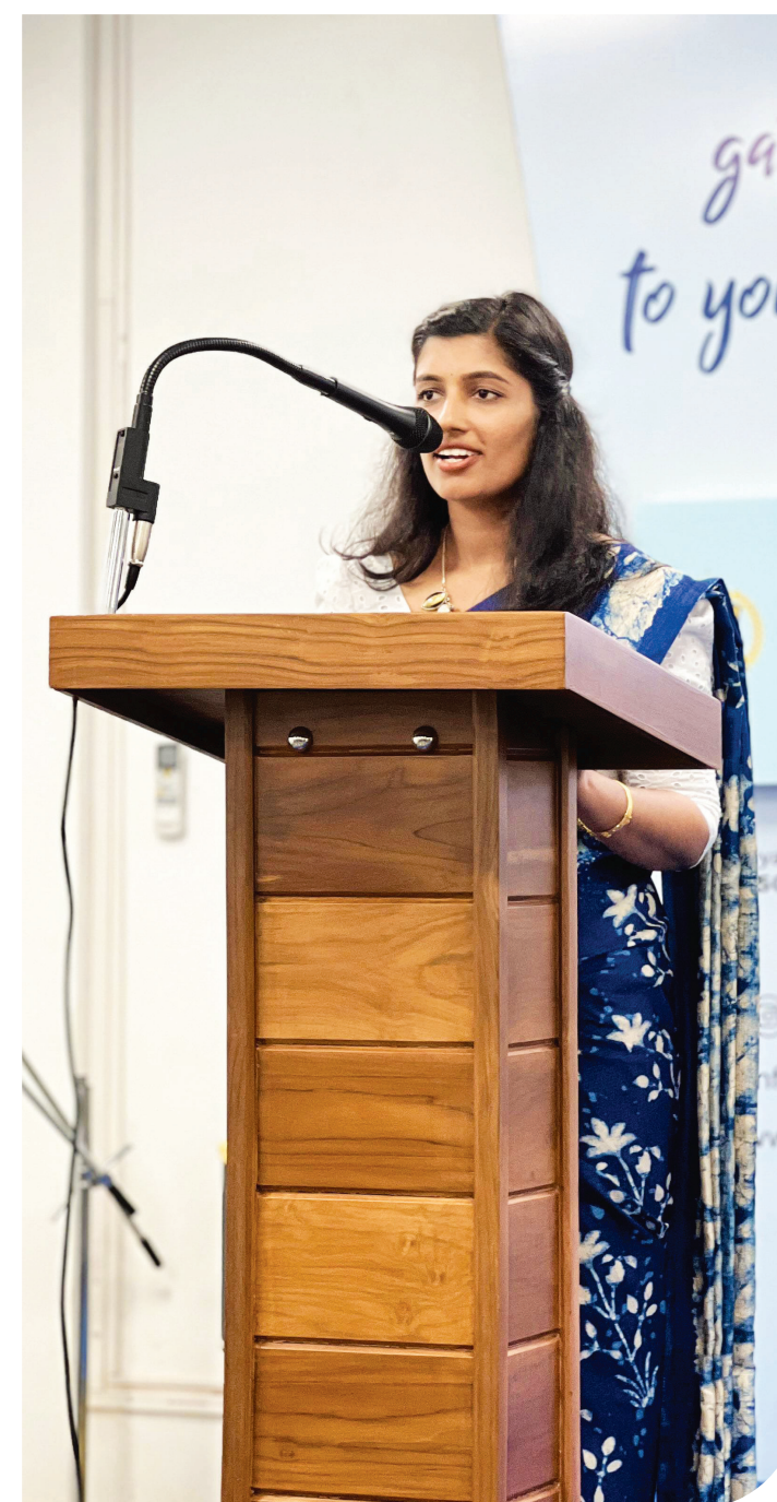
Session on Entrepreneurial traits

The curriculum's blend of commerce and technology equips students with the skills needed to excel in these roles.