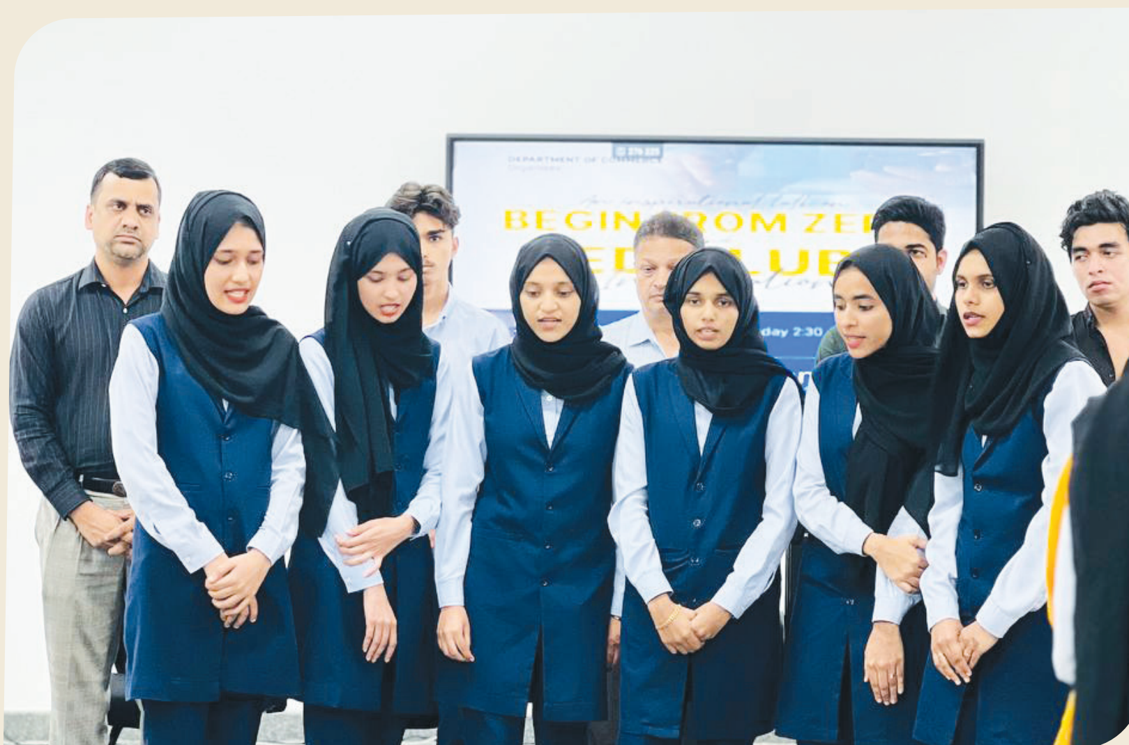
ED Club Inauguration