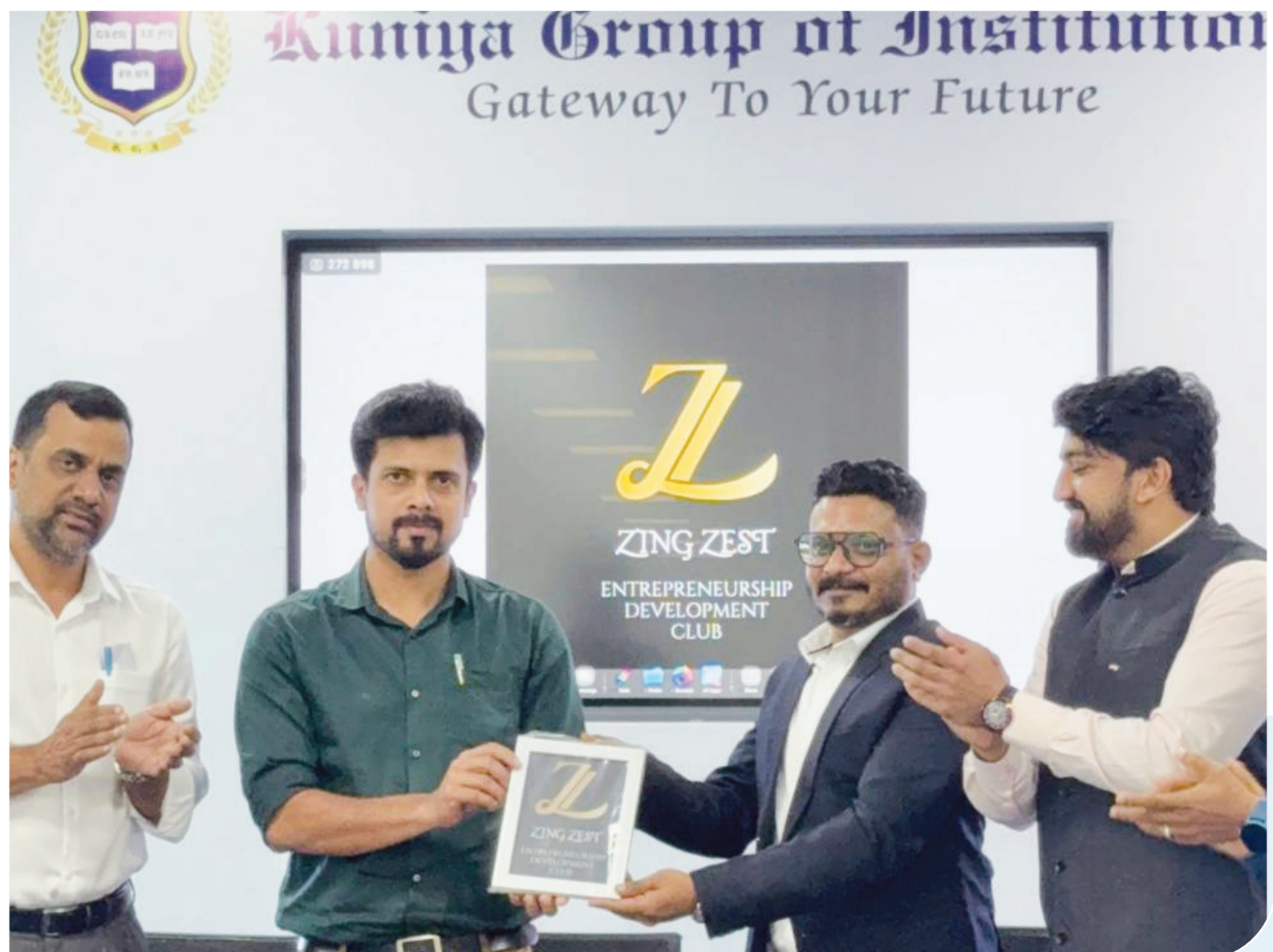
Training program in collaboration with JCI Kasaragod.