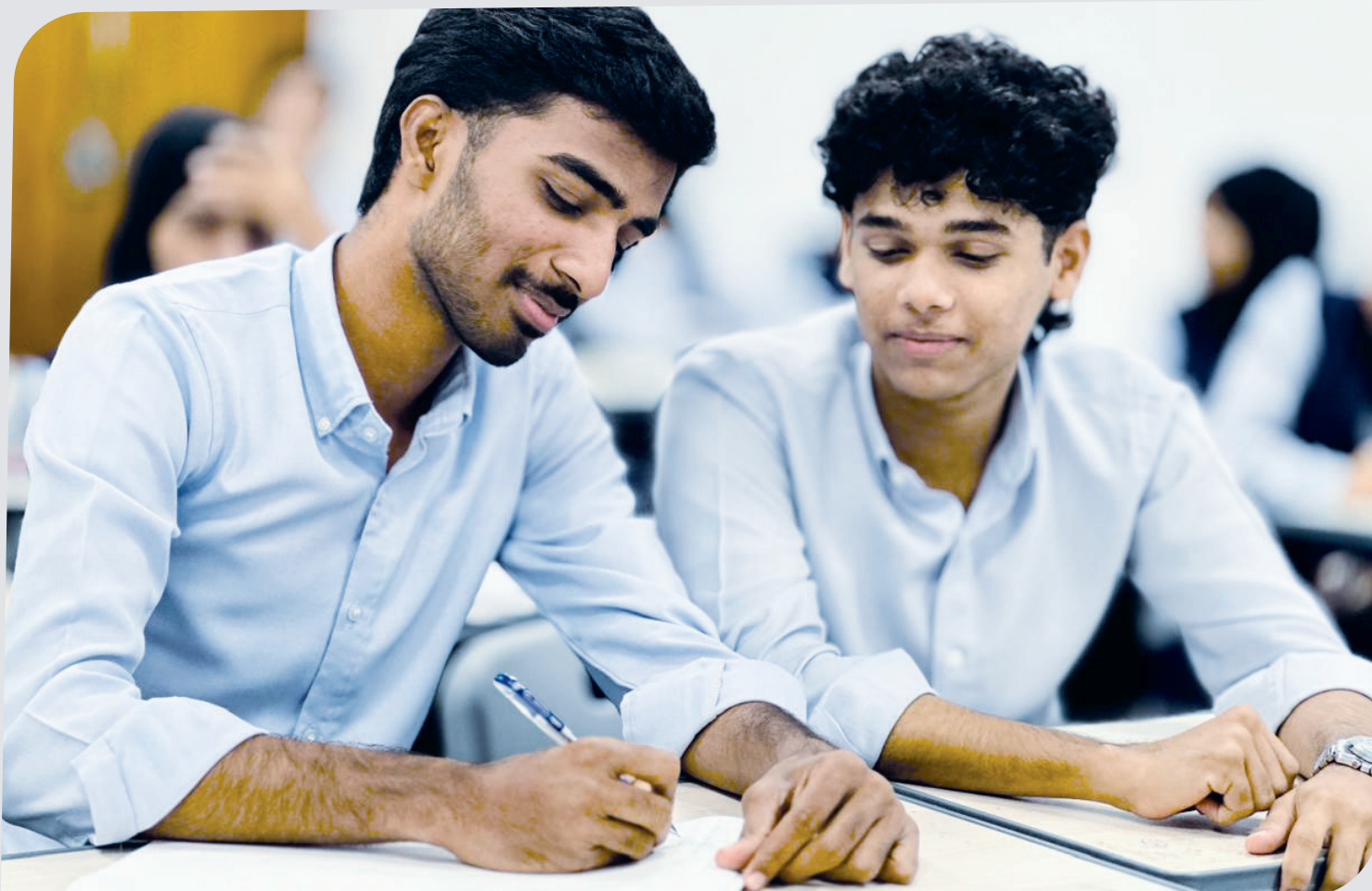
Business Quiz competition