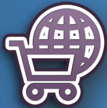
B. Com Computer Application