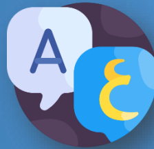
B. A. Arabic & Islamic History