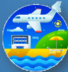
BBA Aviation & Hospitality